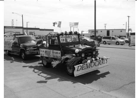
BCDCC Parade entry for 2006 Cinco de Mayo parade in Pasco, May 6th.